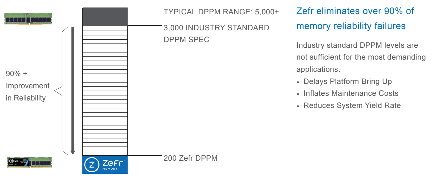
Figure 1. Zefr Memory Overview

Zefr is a proprietary screening process performed on OEM original memory modules or SMART Modular built memory modules to deliver ultra-high reliability for demanding workloads.