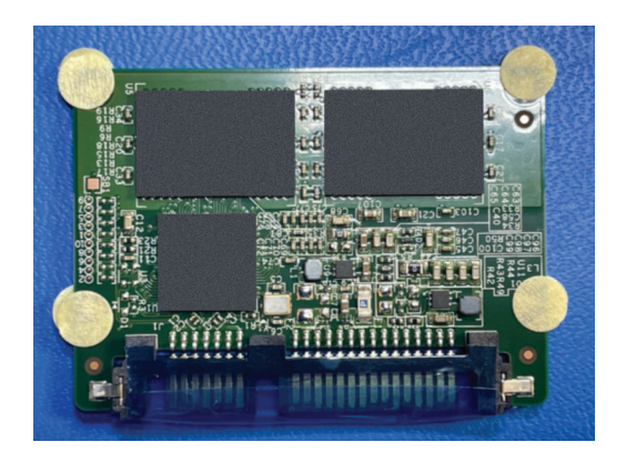
Figure 2: Example showing masking process to avoid sipping of conformal coating material into gold finger areas