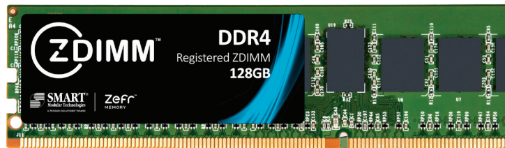
DDR4 Registered ZDIMM

Customer Service: T: (+1) 510-623-1231 • E: customers@smartm.com