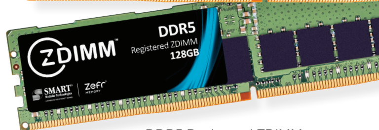
DDR5 Registered ZDIMM