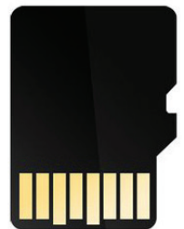
Removable SD Card contacts are contaminated in harsh environments

One of the main problems is commercial deep fryers are typically operated in fast food establishments with significant exposure to heat, humidity, grease and other particulates in a high-volume commercial kitchen. Commercial appliances like deep fryers utilize a small embedded computer to control all aspects of the appliance and cooking process to enable predictable and timely delivery of food products hundreds of times every day. The embedded computer of the particular deep fryer used a removable SD card to store operating and control software.